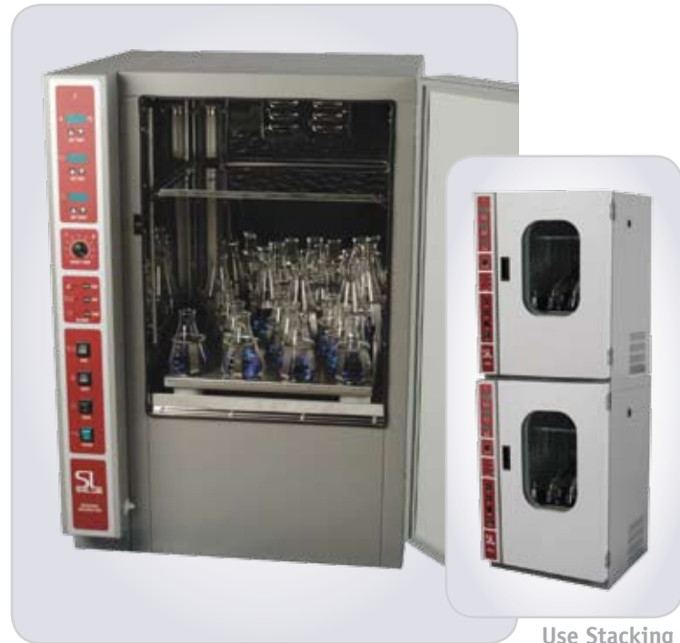
SI6 | SI6R | SI6R-HS