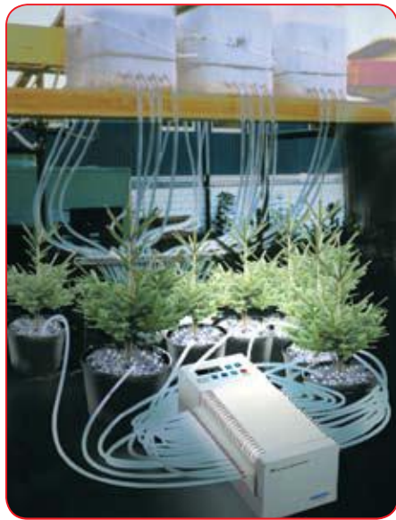
Studies and simulation of the environmental influences of rain water in free-land plants.